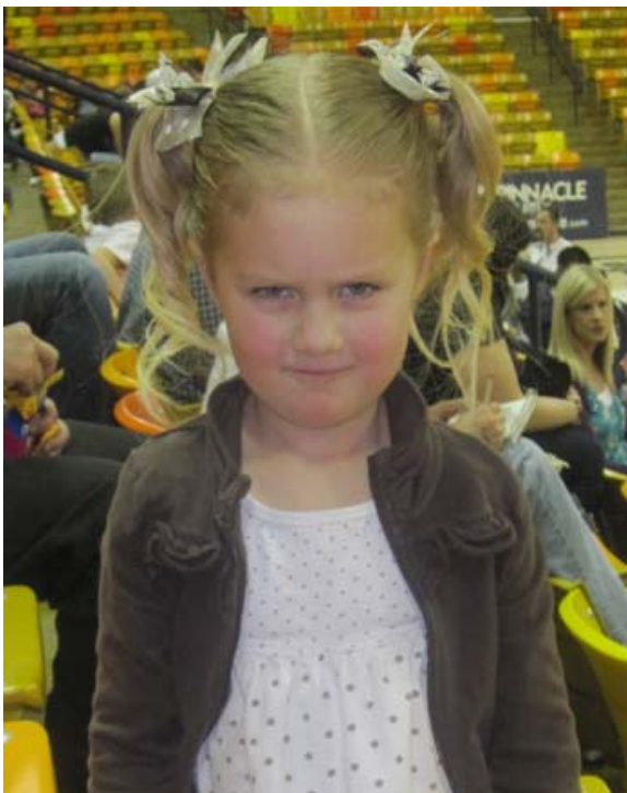
Grandpa, if you tell me to SMILE one more time...

"No. I'm looking for one with money in it." (This kid is after my own heart!)