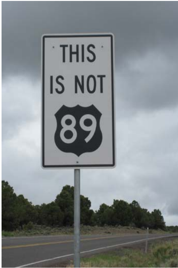
Located on the road to Panguitch Lake about 2 miles AFTER US-89 veered east to Bryce Canyon. Good thing I was going to Panguitch Lake, huh?

"Thank you, airman," the colonel said and strutted away. With a flourish, the airman switched off his flashlight and returned it to his pocket.