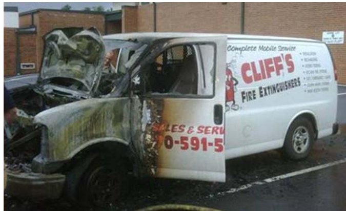
"Going Out Of Business" Sale?

"Really?" answered the doctor, "I don't understand it; my maid said to use hot water."