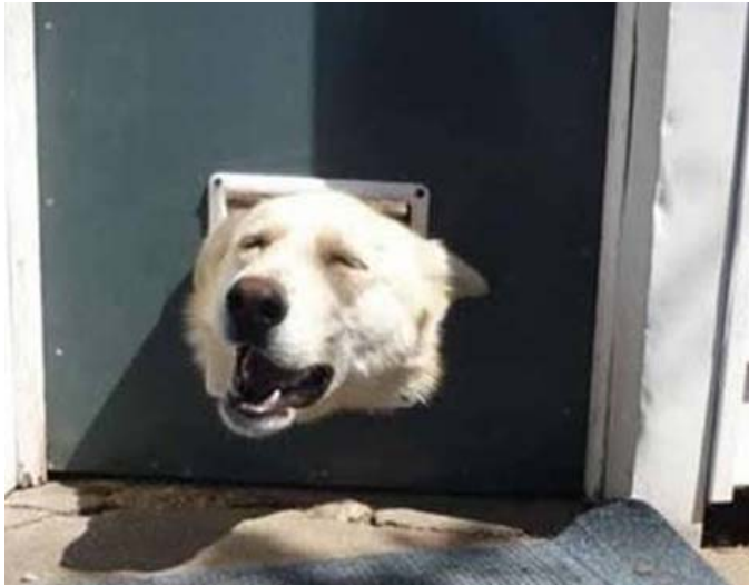
That dang cat!

As one little boy filled his plate, he said, "It's about time! At last ... a home cooked meal!"