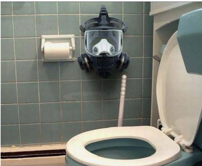
Emergency Use Only