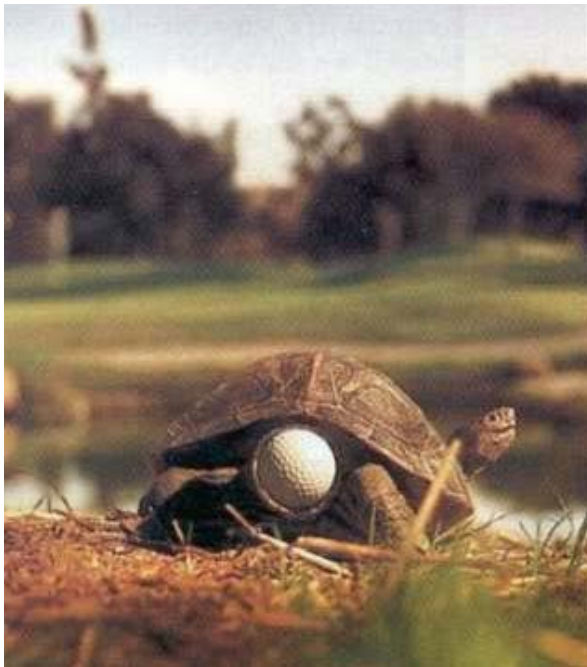
Now THAT'S a Hole-In-One.

I was falling in love all over again when he added, "We gotta get some of these lights."