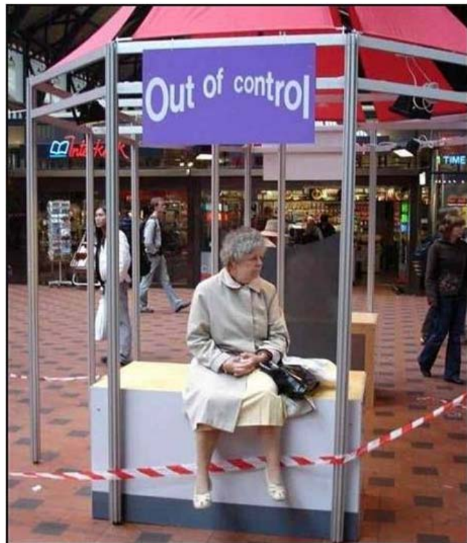
Even Grandmas deserve a "time-out" once in awhile.

"Because," he stormed, "I am sick and tired of taking orders!"