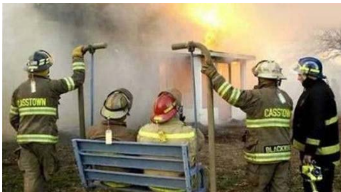
FIRE CHIEF'S EX-WIFE HOUSE CATCHES FIRE. Chief quoted as saying "She has a restraining order against me and all my family and since us guys at the fire house are just one big family . . . "