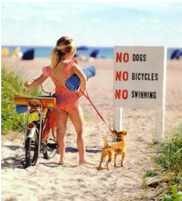
Now THAT'S a sure sign it's going to be a bad day at the beach.

"Yep. Right before he died it said, 'Don't they sell any birdseed at that pet store?'"