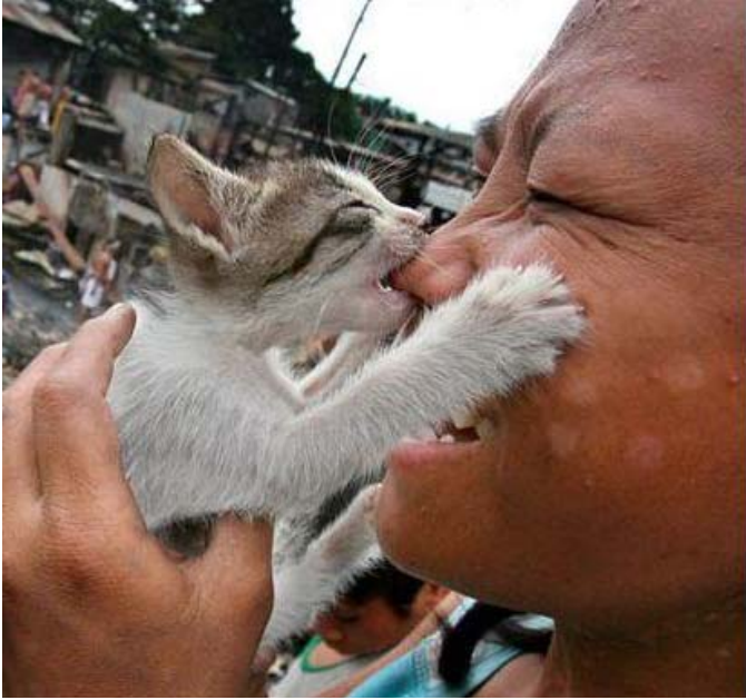
I really HATE cats!

Later that evening my son walked through the door, home for a surprise visit. Taking one look at my coat-hanger friend sitting on the couch, he said, "Mom, it's not that bad, is it?"