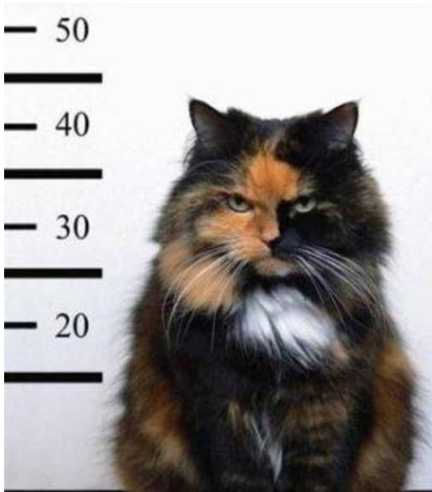
Listen, ya dumb cop – THE STUPID DOG STARTED IT!

A couple in Sweetwater, Texas had a lot of potted plants, and during a recent cold spell, the wife was bringing a lot of them indoors to protect them from a possible freeze.