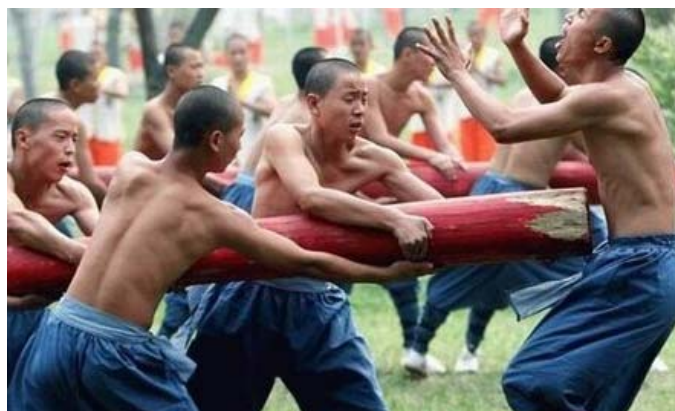
New 8-Second Workout to develop "hard" abs.

"MUST HAVE AN EYE FOR DETAIL": We have no quality control.