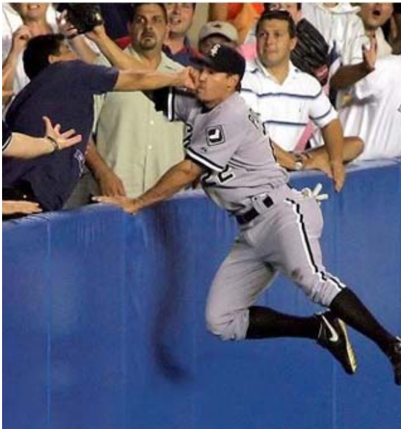
Yes, FANS can be dangerous to your health!

"But I must tell you that I had an aunt who was a Baptist (loud cheers!) ...and I have always considered my aunt's path to be the right one!"