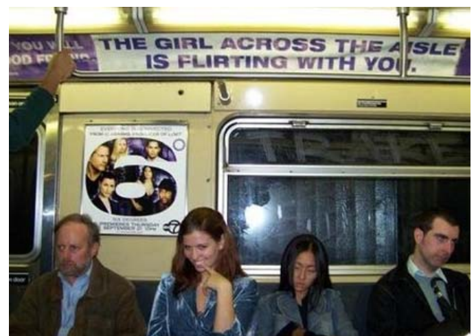
Sorry, Elder. You still have six months left.

One day my Boss asked for a status report concerning a project I was working on. I asked him if tomorrow would be soon enough. He said "If I wanted it tomorrow, I would have waited until tomorrow to ask for it!" ( New business manager, Hallmark Greeting Cards. )