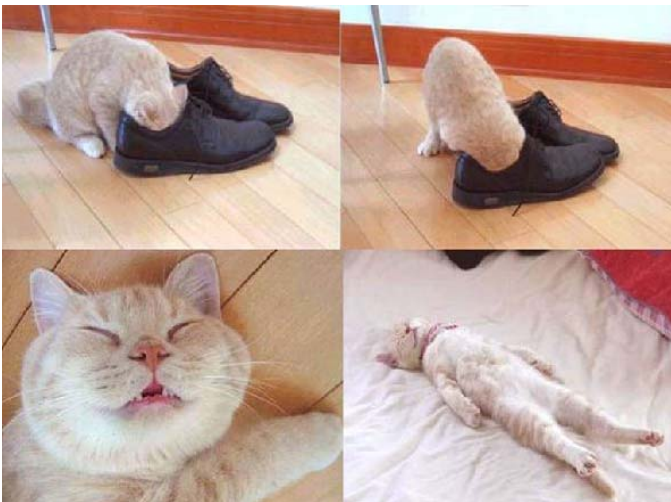
AND curiosity got the cat!