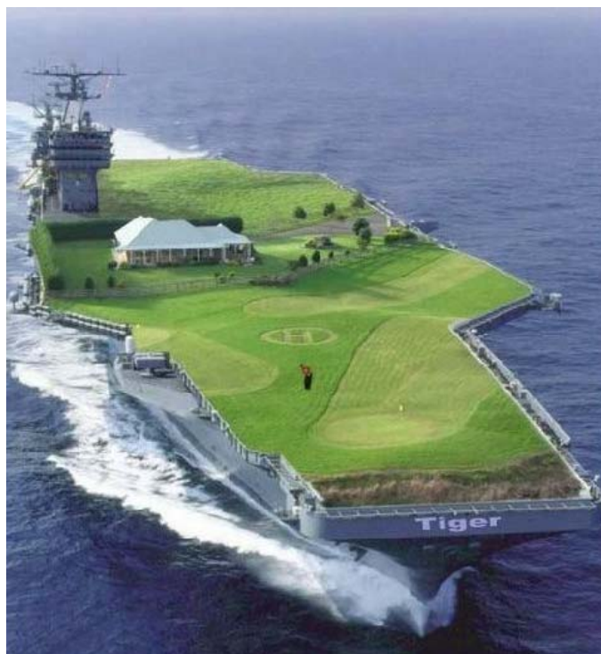
The Admiralty has contingency plans for decommissioned aircraft carriers.

The husband reached up to the dash, grabbed an open box of snacks, and said, "Here, have another cookie."