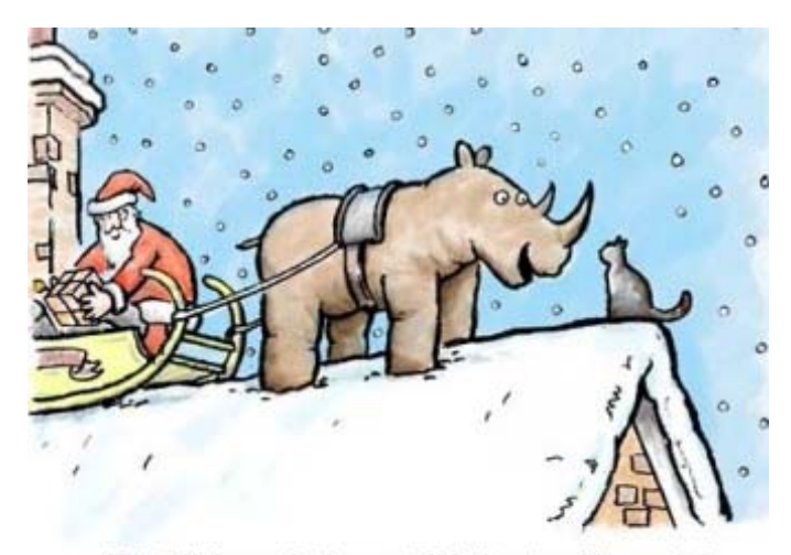
'That flying reindeer stuff is just a silly myth.'

Not only was the revolt successful, it was the first time in history that ... a reign was called on account of game.