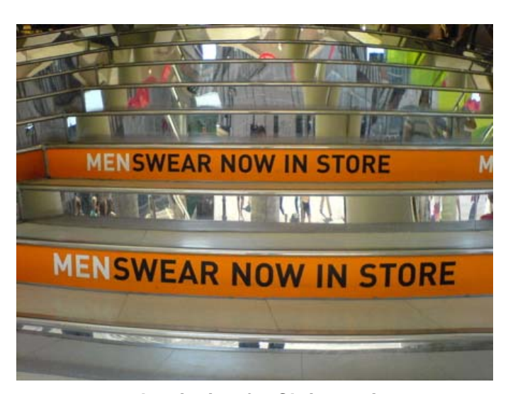
Just in time for Christmas?

"Oh, it's nothing to worry about" says the caretaker. "He's just decomposing!"