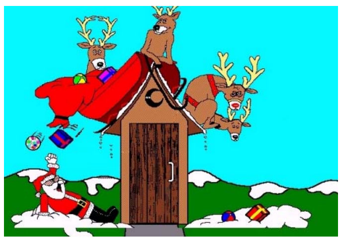
"I said the Outlander house...not the OUT house!"

We should've known when they were able to find their way.