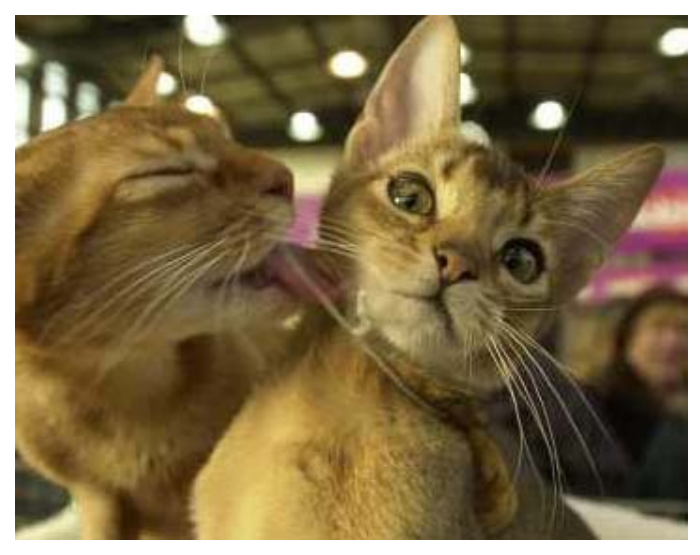
The dreaded "New Year's Kiss"

You are making progress...if each mistake is a new one.