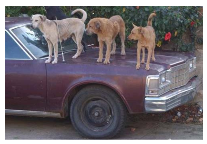
"Redneck Car Alarm"

Observing all this, our 'nosey' next-door neighbor asked, "Hey! Ray, are you going to put that patio away 'EVERY' night?"