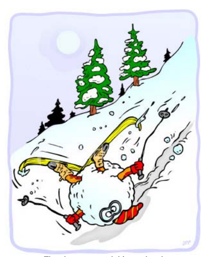
The slopes opened this weekend...

I'm full of tomatoes and french fried potatoes My stomach is swollen and sore, But there's still some dessert so I guess it won't hurt if I eat just a little bit more!