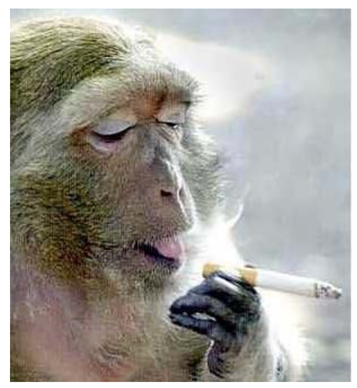
"Smoking puts hair on your chest...and your face, back and arms...makes your lips stick out, turns your fingers black...and makes you look a lot older than you really are. I'm 23!"

"I was afraid he was going to ask if the lantern was lit!"