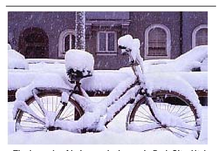
The hazards of being a missionary in Park City, Utah.

A little fellow shouted, "Cause your feet ain't empty."