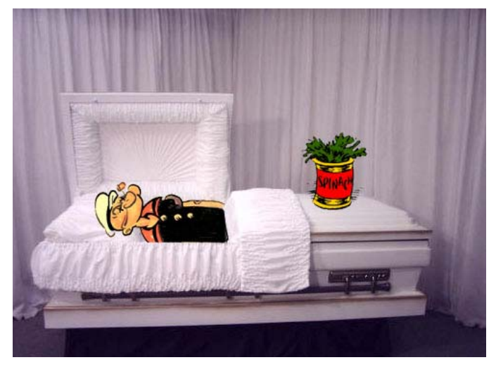
The Latest E-coli Victim

I was examining cantaloupes at the grocery store and turned to the produce clerk, who was refilling the bins.