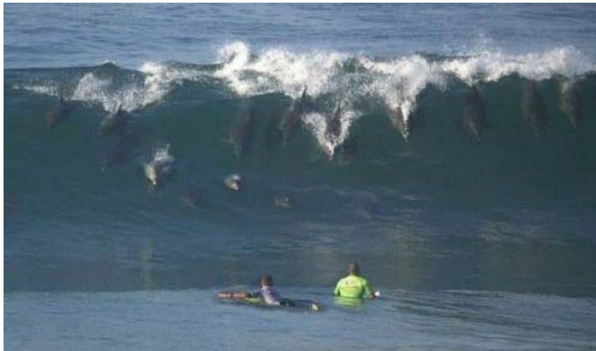
It soon became apparent why it was named Dolphin Beach.

"If you're buying it from me, it's a violin. If I'm buying it from you, it's a fiddle."