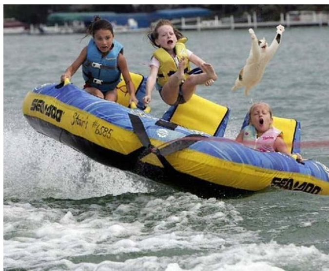
Who brought the cat?