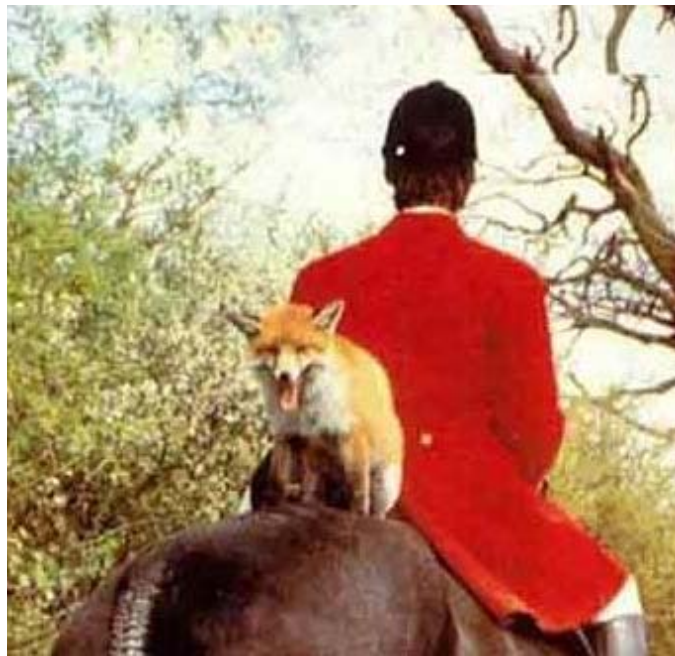
Gotta love 'the hunt'!

"The advantage is that you can always tell which way the wind is blowing."