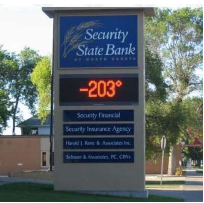
Is this what they call a "frozen" asset?

Delighted, she opened it to find a book entitled "The Meaning of Dreams."