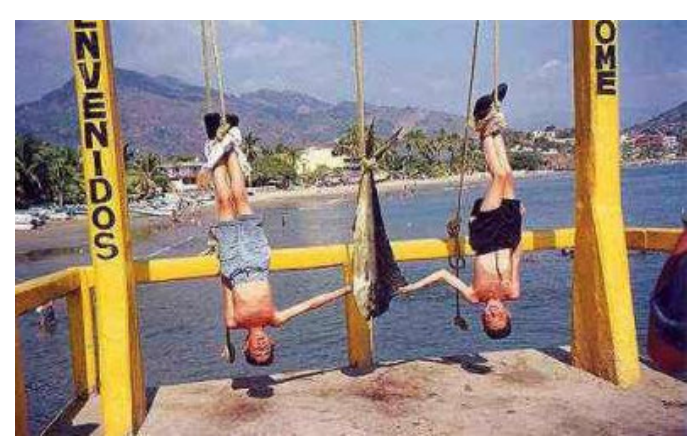
It's amazing what you can catch using hotdogs for bait!

The best thing about the future is that it comes only one day at a time. --Abraham Lincoln