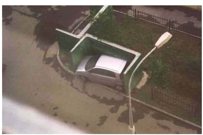
Somebody really knows how to parallel park!

"Naturally," the chef said. "Over there, they use domestic cheese. Ours is imported!"