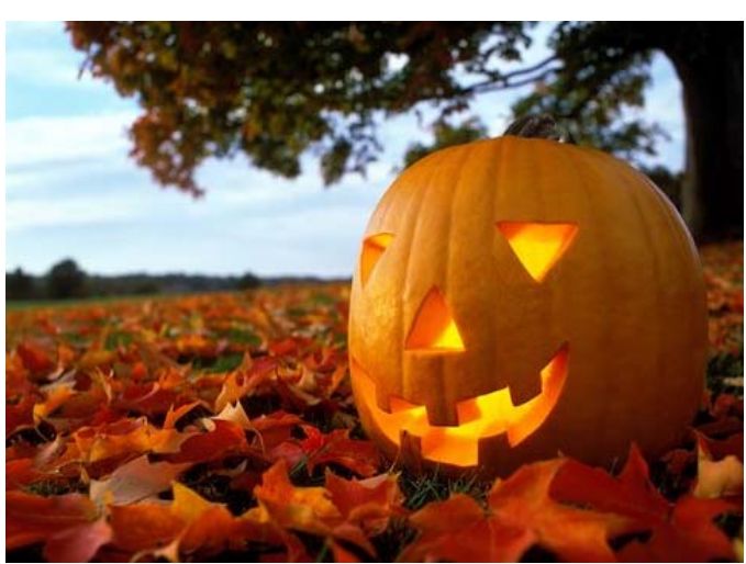
Have a HAPPY HALLOWEEN!

For many years I worked as a receptionist and switchboard operator at a busy company. After a good annual review, my supervisor told me I was up for a raise, pending approval of the vice president.