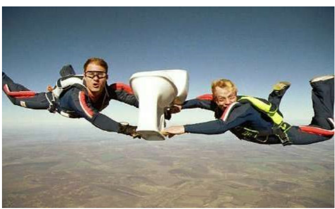
In case of air sickness!

"Oh, no..." says the knight. "Well, you do now."