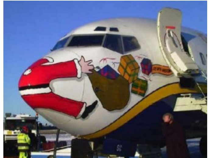
"Somebody is in BIG TROUBLE!"

When the man came home, his wife was crying. "Your mother insulted me," she sobbed.